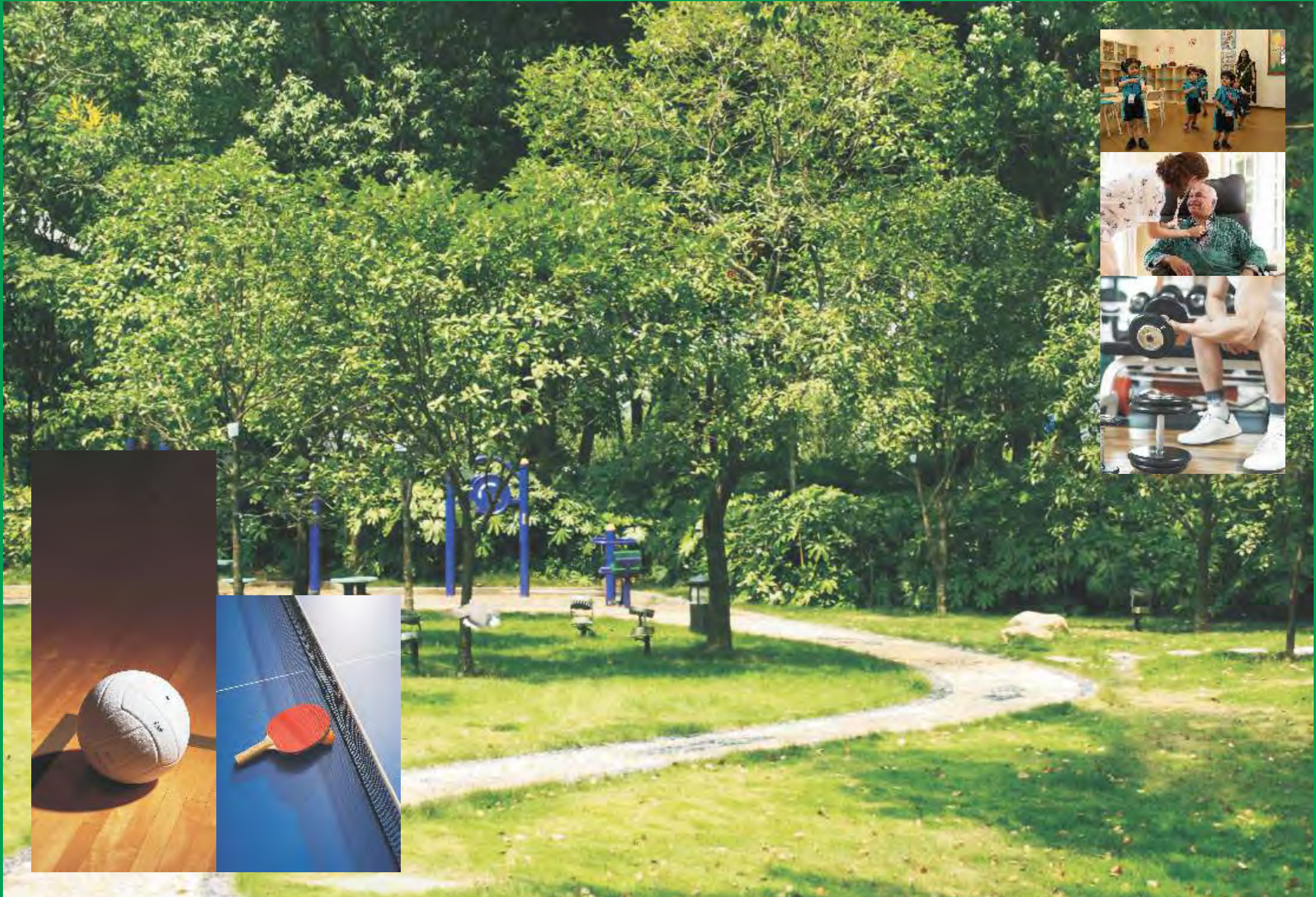
This image (s) displayed is only an artistic impression and not the actual photograph. Elevation, colour scheme and / or exterior appearances are subject to change and can be altered at the sole discretion of the company. This is purely conceptual and constitute no legal offering.