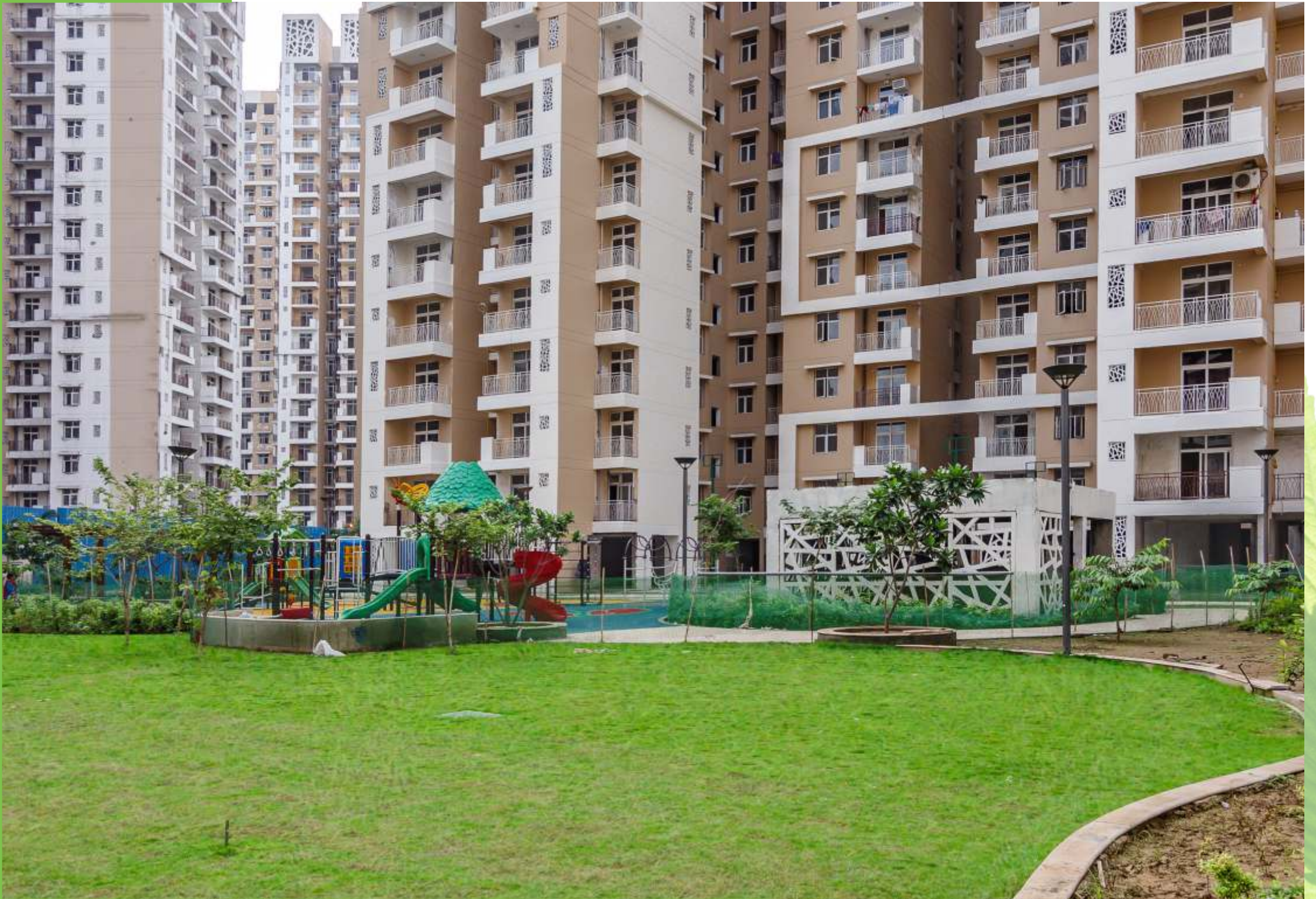
Actual Site image