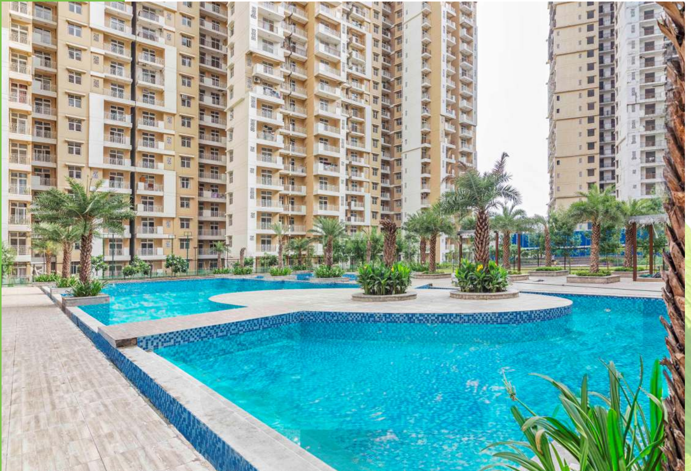
Actual Site image