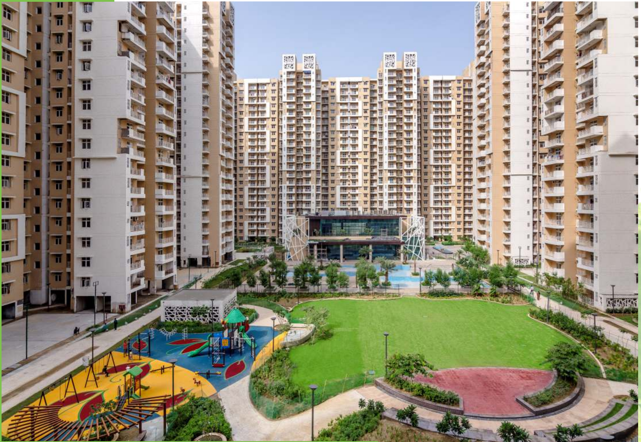
Actual Site image