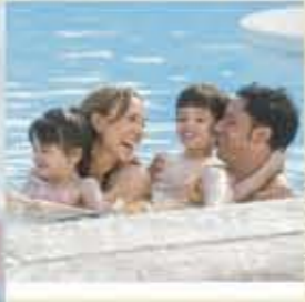
* Conditions apply