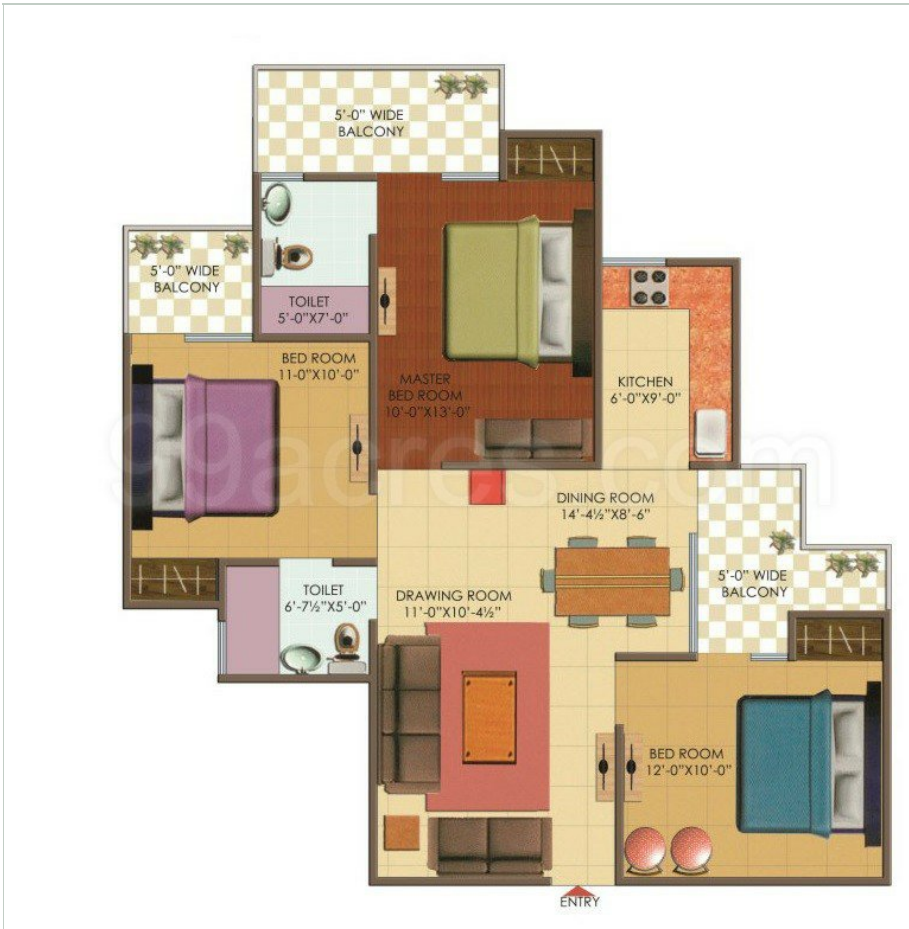
3 BHK(4) Super Area: 1250 sq ft, Apartment