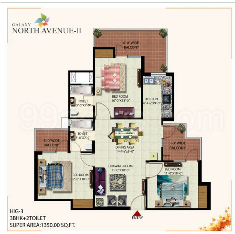
3BHK+2T(5) Super Area: 1350 sq ft, Apartment