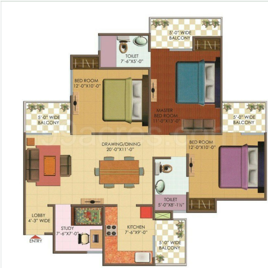
3 BHK(6) Super Area: 1430 sq ft, Apartment