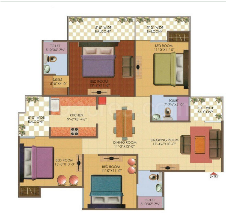
4 BHK(7) Super Area: 1755 sq ft, Apartment